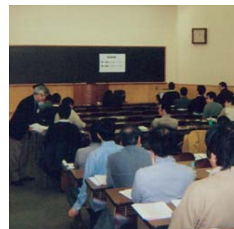
Students taking CIIA examinations Japan

the CIIA diploma becoming a truly international designation.