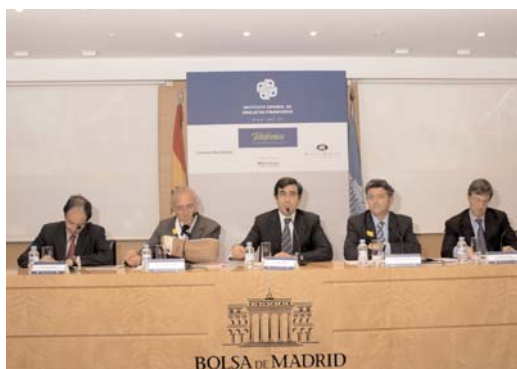
Presentation in Madrid Stock Exchange