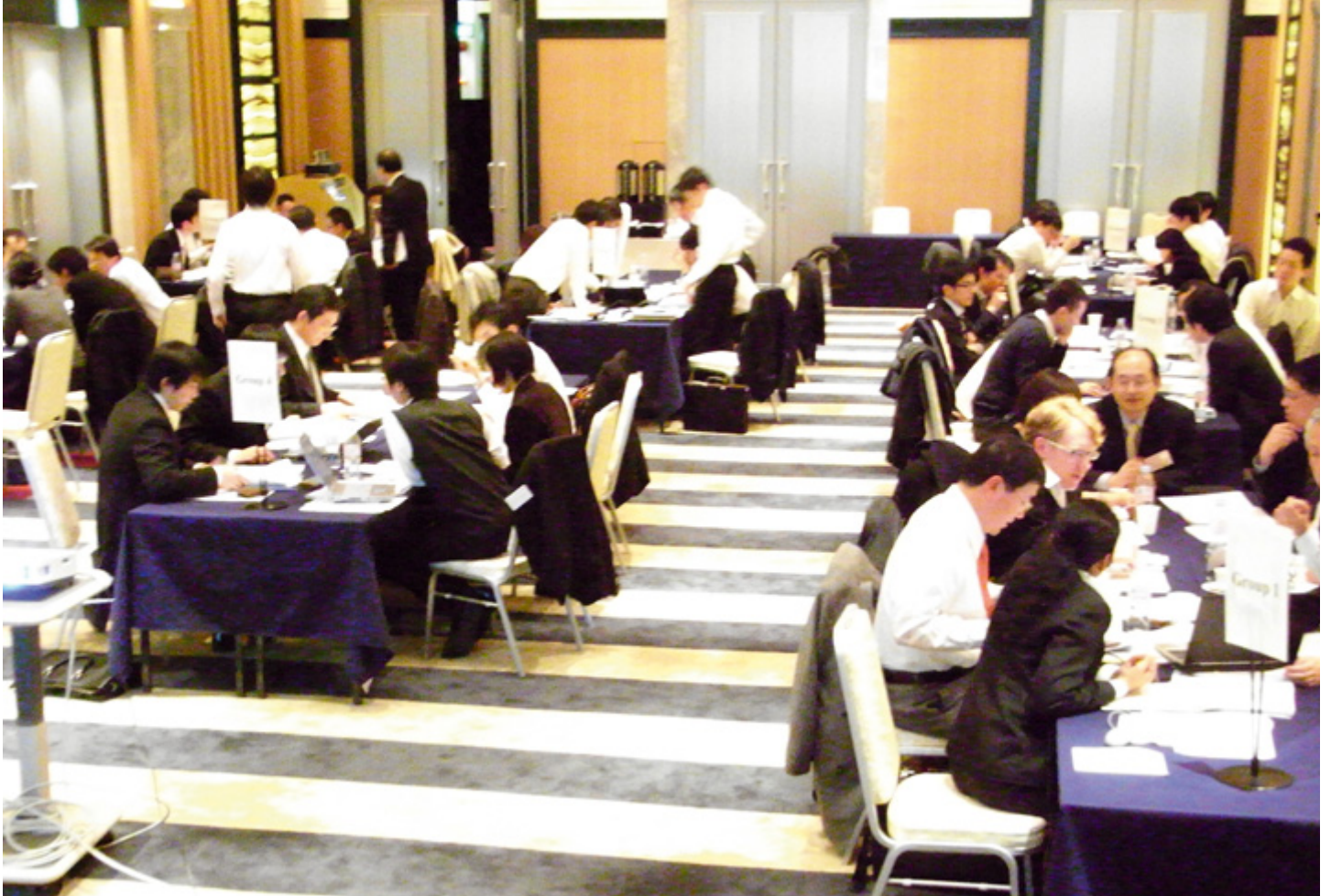
Students taking part in the case study

The last such joint seminar, but seminars will continue under SAAJ